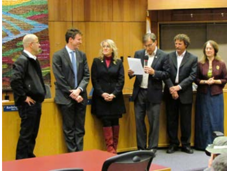
Business of the Year Awards