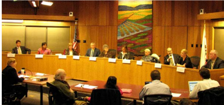
League of Women Voters Council Candidates Forum (2/16/11)